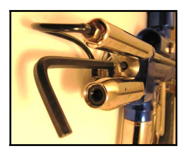
Note that you will not remove the banjo bolt from the front block. The front block will move away from the marker as you remove the banjo bolt and allow you to remove it.

Use a 3/16th Allen Key to remove the Front Block and Pneumatics. The 3/16th Allen Key inserts into the flat headed 'Banjo' bolt in the front of the front block and with a bit of muscle comes off the marker. In the case of the 2004 Prostock® it took 8 turns to take the banjo bolt off the marker enough to take the front block off.