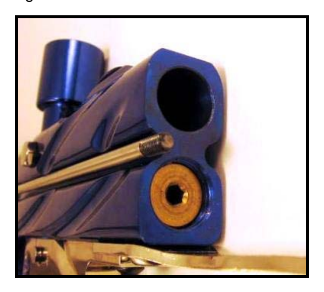
Your marker will look like this once the Bolt, Bolt Pin, Cocking Rod, and Back Block have been removed.

Unscrew the back block from the marker. You may need to flex the cocking / pump arm a little - but this is okay. In my the case of the 2004 Prostock® it takes about 10 full turns to get the back block off the marker.