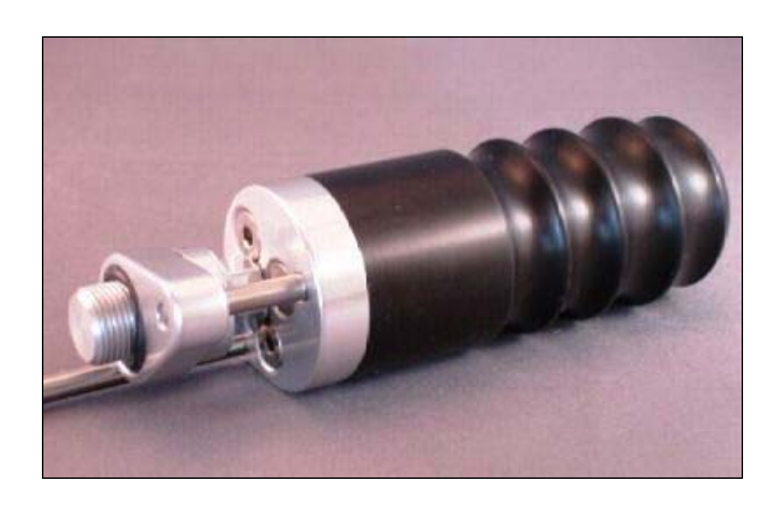
Chipley Custom Machine Deluxe Kit Manual