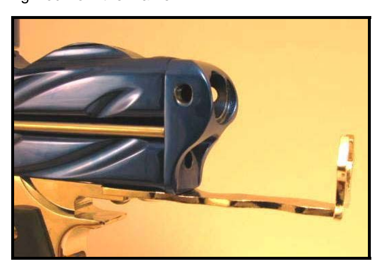
The back of the marker as it looks after Step One and Two.