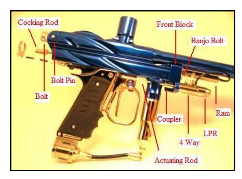
Schematic of a 2004 WGP Prostock® Autococker®. Your 'cocker might differ – but the parts are essentially the same.